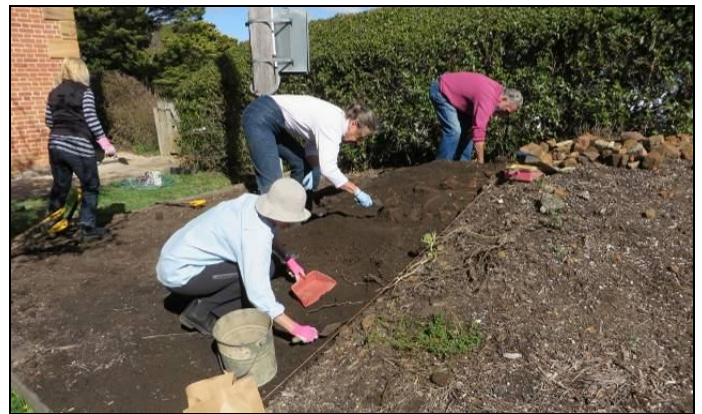
Day 1 - Carefully removing the top soil