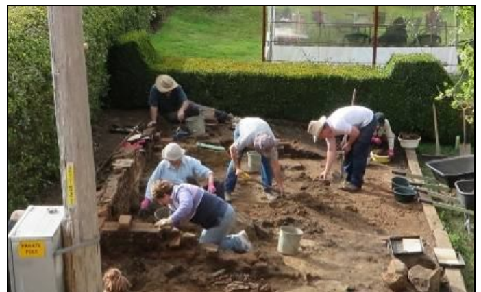
Day 3 - the partition wall appears