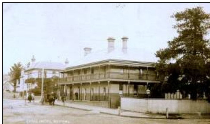
The Royal Hotel Bowral opened 1878, pictured here c1903.

The earliest inns in the local district followed the old South Road, before Berrima was surveyed in the 1830s on a new line for the Great Southern Road. A regular stream of traffic then passed through the Berrima district. By 1879 there were 17 inns and hotels listed, including at Nattai (Mittagong), Bowral, Robertson and Marulan. By 1900 only nine inns were listed. The Royal Hotel was the sole hotel listed in Bowral, even though there were three hotels trading at that time. As the population grew in the districts of Moss Vale and Picton, licensing courts were established. After 1922, Publicans' Licensing Courts were held in the local area and the names of the hotels and licensees appeared in local newspapers such as the Scrutineer .