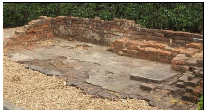
Day 5 - the site as it will be displayed showing evidence of continued use as a functional building over 150 years.