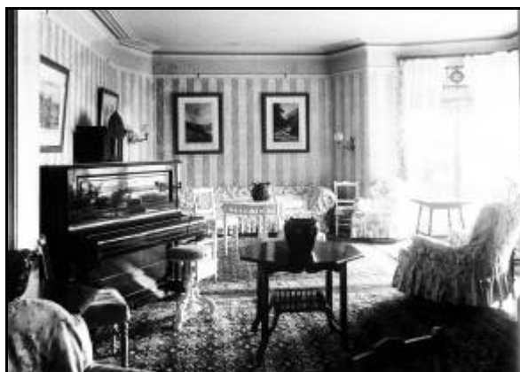
Hillview Drawing Room

A permanent conservation order was made on Hillview in 1986 and negotiations for a long-term lease began based on a proposal to convert and upgrade Hillview into a guest house and museum. The upgrade is nearing completion and it is intended that the historic property will be open for inspection.