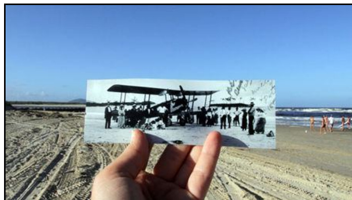
This image is from the ABC website