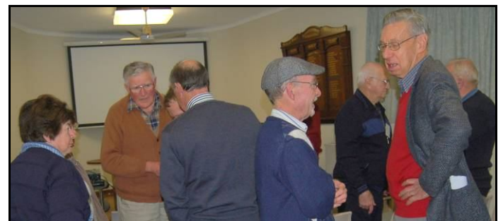
Plenty of discussion afterwards!