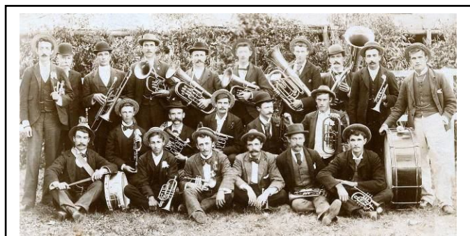
By 1896 the number of bandsmen had doubled

The Band's next public engagement was at Burrawang on Saturday, 9 November, 1895.