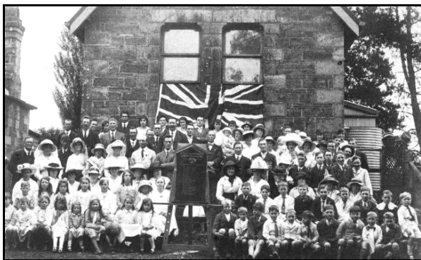
Unveiling Honour Hall at Avoca Public School, November 1918

Whether they fought in the trenches of Gallipoli, flew bomber aircraft, tended the wounded, worked on broken engines or cooked meals for the troops, every person who served in the Australian Military Forces during the conflicts put their own life on hold to help defend Australia.