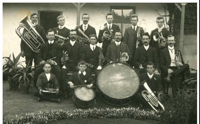
Bowral Band at Farm Homes Mittagong, 1908