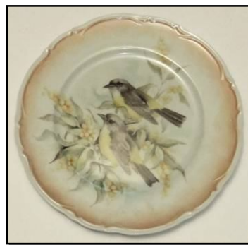
Eastern Yellow Robins

This hand-painted plate is now amongst the many other fascinating acquisitions at the museum in Berrima.