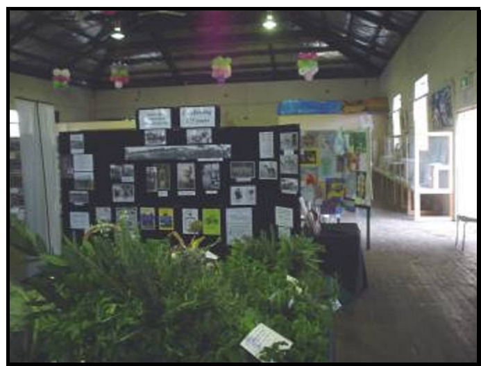
Our display was well positioned with the junior art display on one side and local produce exhibits on the other