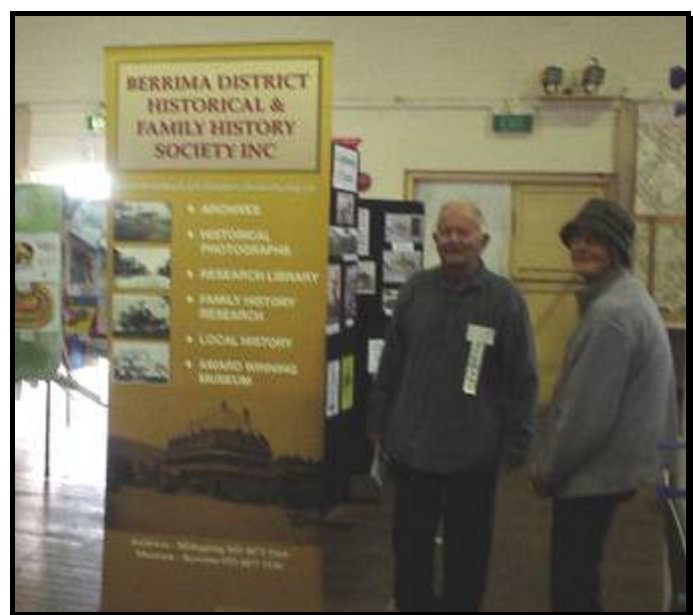
The pavilion stewards kept an eye on the display