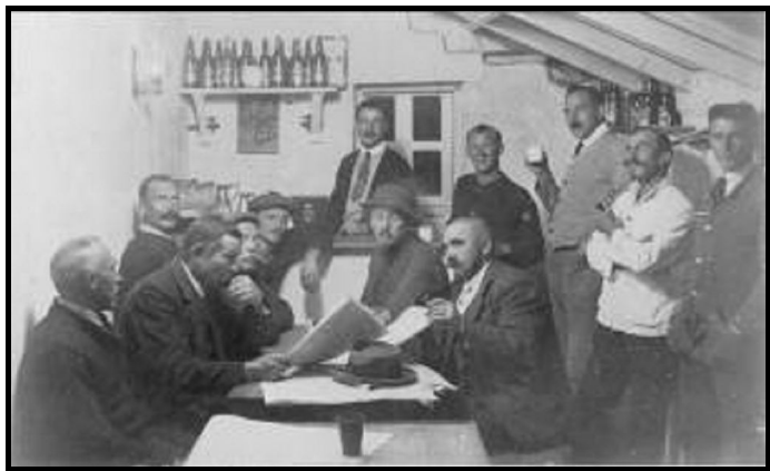
WAR DRAGS ON: Mariners ponder the news from home.