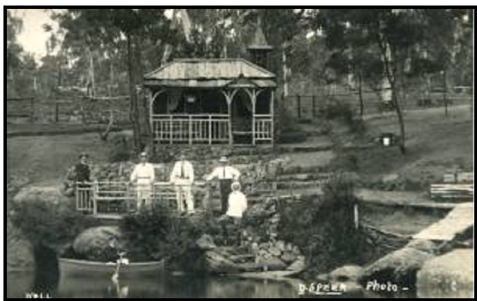
WATER VIEWS: On the bank of the Wingecarribee River is the Emden POW's hut 'Castle by the Sea'.