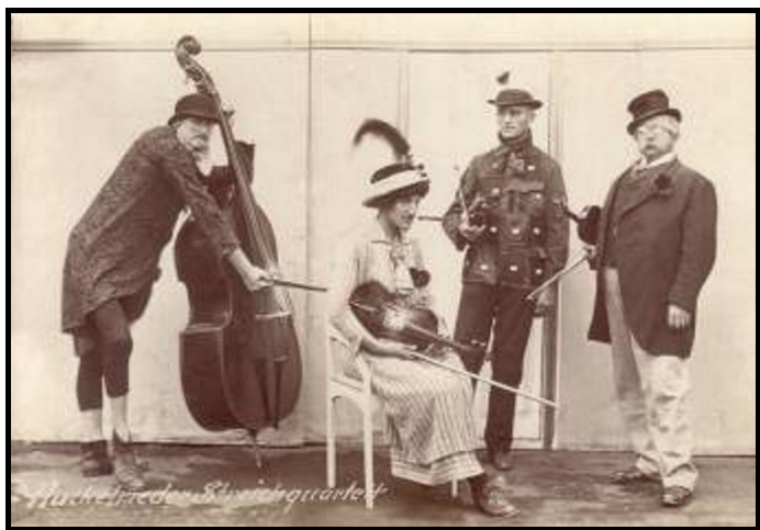
HUCKELREIDER QUARTET: fancy dress, fine music.