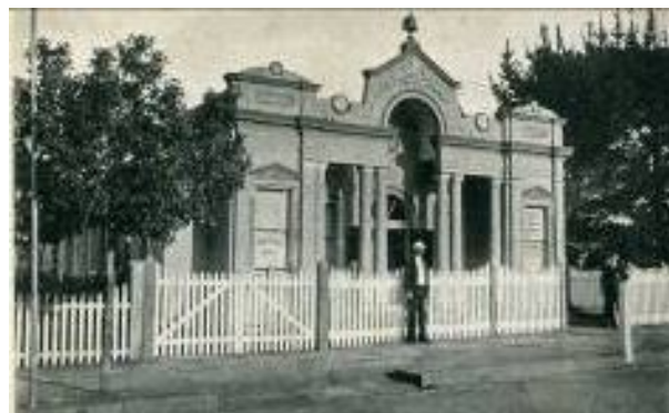
Bowral School of Arts in Bendooley St, c.1900 operated a library which expanded with the growth of the town

The Berrima District Historical & Family History Society congratulates the Wingecarribee Library Service on making available this valuable local history collection and research centre.