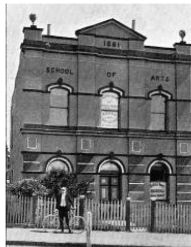
Moss Vale School of Arts in Argyle St. served as library until 1971