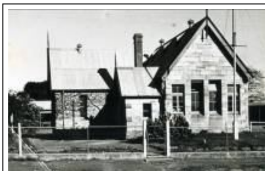
The original Mittagong Public School building became town library in 1977