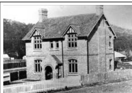
Mittagong School of Arts housed a library from 1899