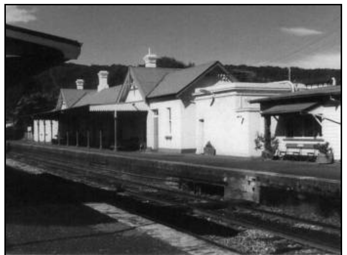
David's recent photo of Bowral station - looking north. The main building (photo centre, on the Down track) was erected about 1890.