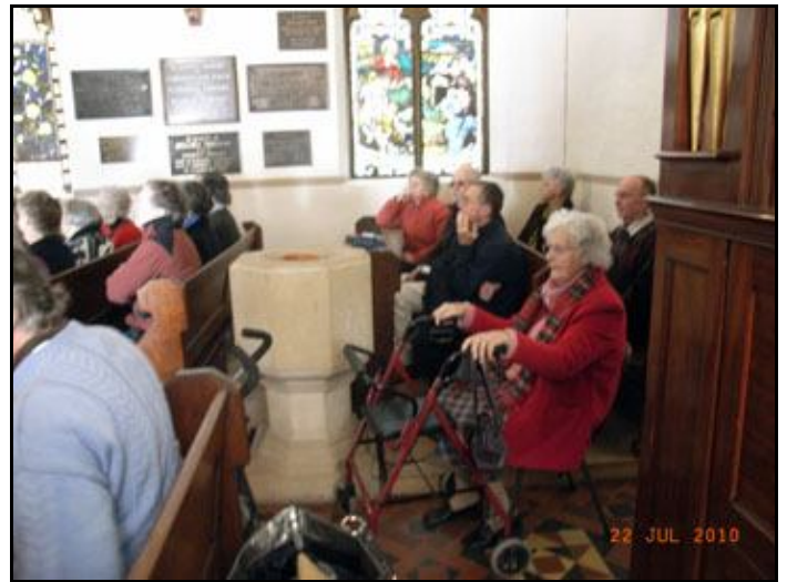
Even the back pews are taken!