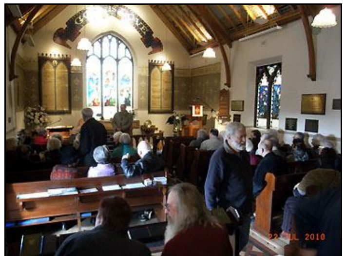
After the talk, everyone was invited to take a closer look at the restored features of the interior of the church.