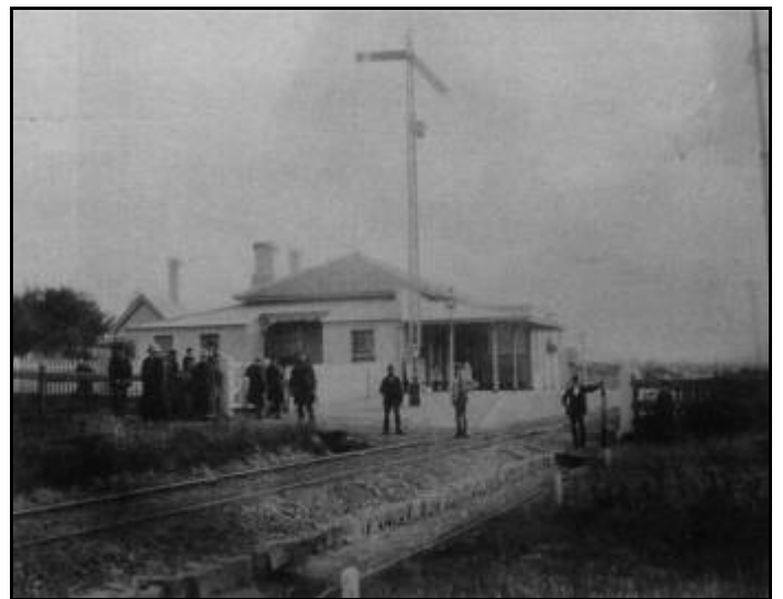
The first Bowral station in the 1880s. Note the Down signal at Stop and the Up at Clear on the one post.

Where Trains Have Travelled is illustrated throughout with a multitude of photographs, some from earlier times, along with many more recent colourful images taken by the author, that serve to illustrate the brief histories he provides of the many ruins and of the outstanding features of the lines still in existence.