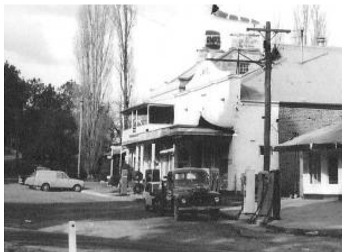
ANOTHER VIEW: Berrima's Ampol garage and kiosk pumps taken in the late 1960s.