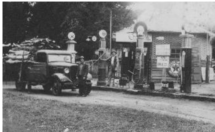
STAR SERVICE: 'Star' roadside kiosk operated by Fred Simons in the 1930s on the highway through Berrima.

Berrima thrived until the Hume Highway by-pass was opened in 1989 and traffic no longer came through town. However that was the catalyst for the remaking of the village into a living heritage site; people now go out of their way to visit.