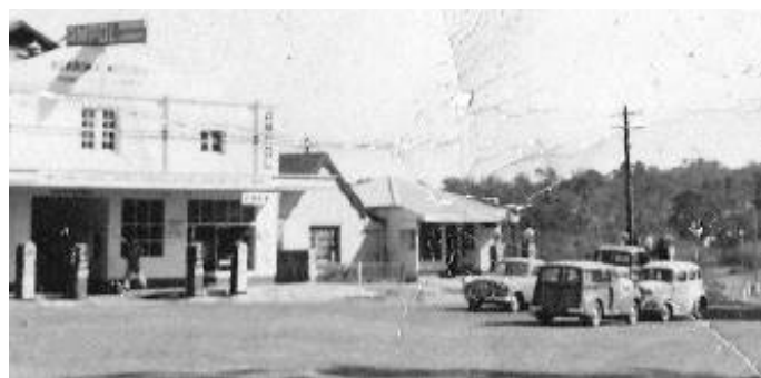
PLENTY OF PUMPS: The Ampol garage and kiosk petrol pumps at Berrima in the busy 1950s on the site where the Alpaca Centre is now situated.