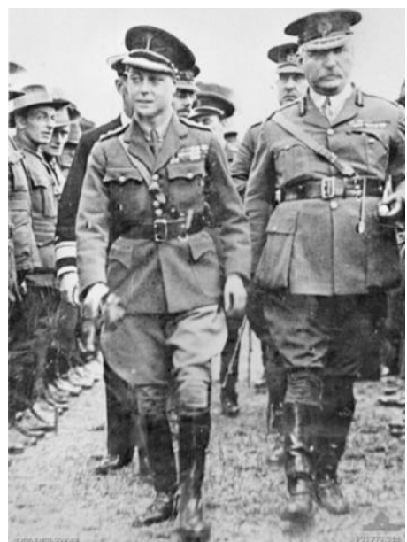
Brigadier General Ryrie, followed by Sir John Monash, escorts the Prince of Wales.