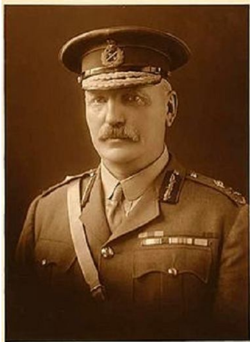
Granville Ryrie (1919)

Major General the Honourable Sir Granville de Laune Ryrie (1865-1937) KCMG, CB, VD, 1st AIF, Commanding Officer 2 Australian Light Horse Brigade.