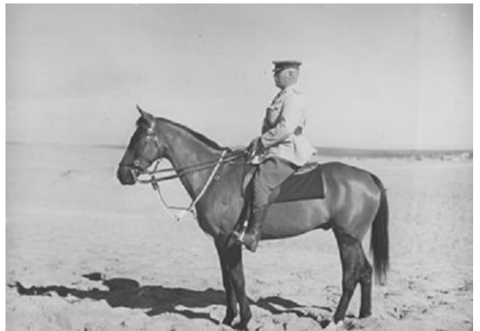
Brigadier General Granville Ryrie on his horse, "Plain Bill"

Ryrie received the Commander of the Order of St Michael and St George (CMG) in 1916, Companion of the Order of the Bath (CB) in 1918, Knight Commander of the Order of St Michael and St George (KCMG) in 1919.