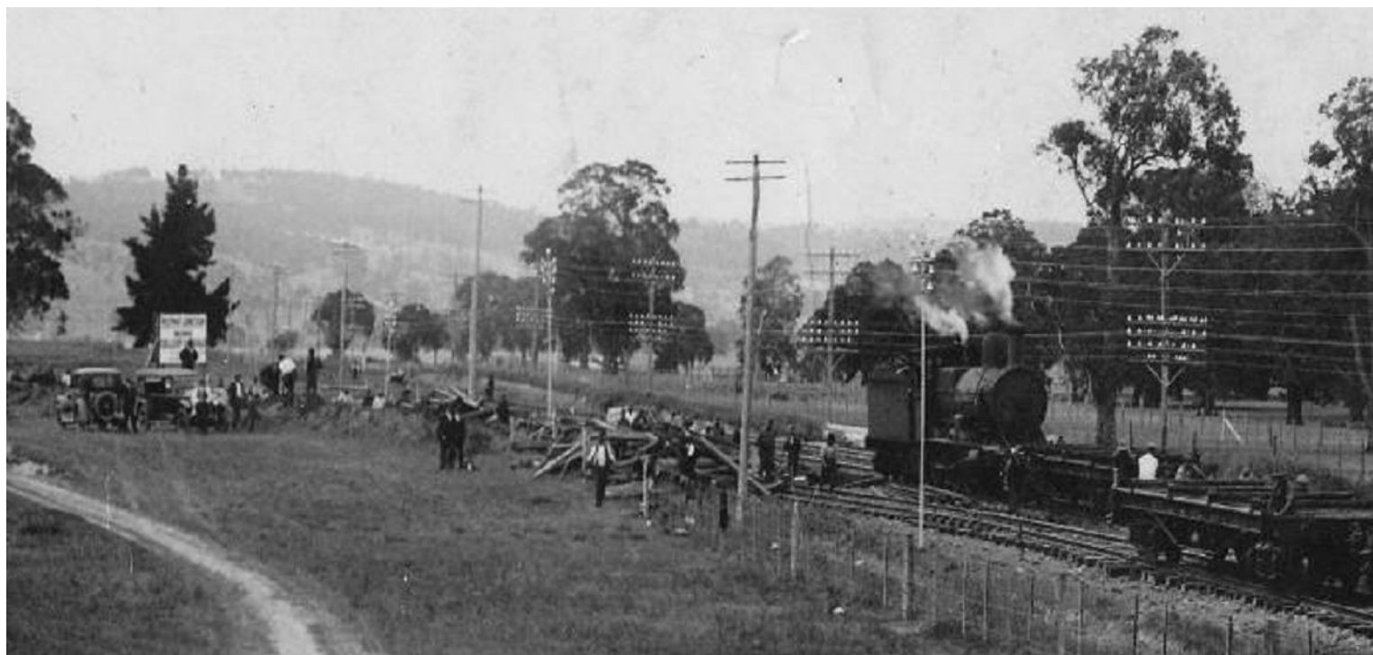
CONFUSING NAMES JUNCTION: The old private rail line to Medway is shown here being reconnected to the main Southern Line in 1927 by the Southern Portland Cement Company near the locality originally known as Austermere.