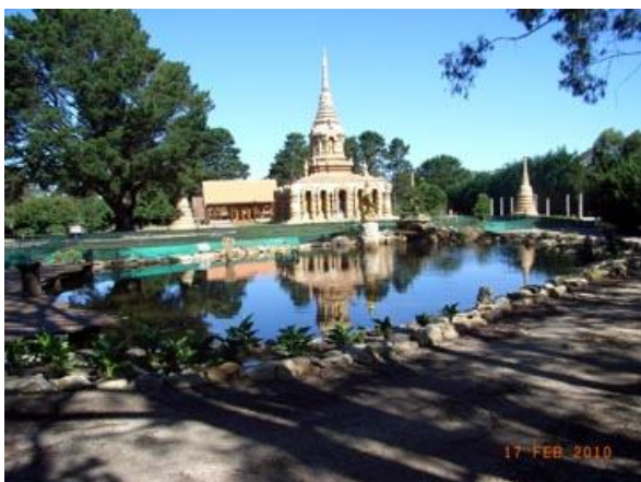
The main pagoda and lake at Sunnataram monastery.