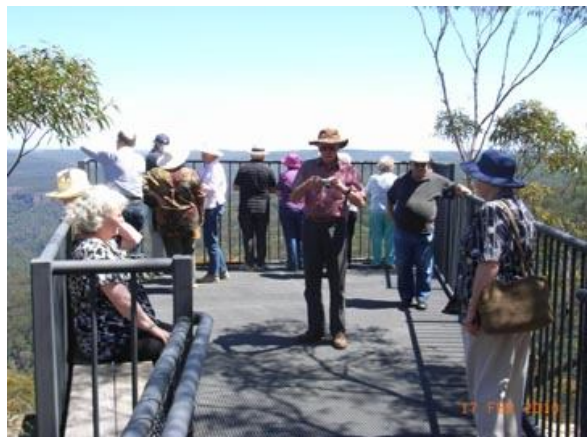
Another view of members at Echo Point lookout.