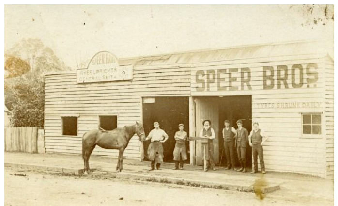
NEW SHOES: Bowral blacksmiths, on corner Bong Bong and Banyette Sts, with staff and satisfied customer, c1895.