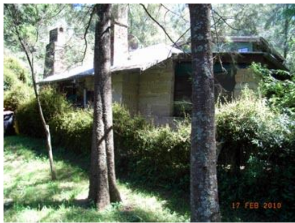
Jackman's Cottage, Bundanoon.