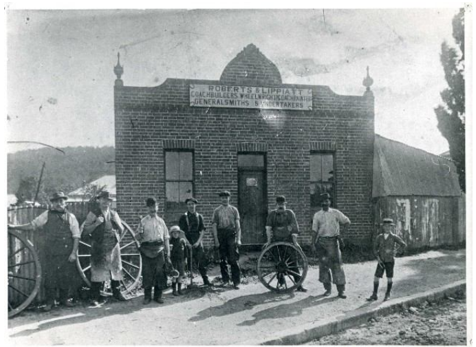
MOVING ON: In 1914, Roberts & Lippiatt, of Mittagong, were coachbuilders, wheelwrights, general smiths and undertakers!

Yet horses still require shoes to be fitted. Here in the Southern Highlands at least ten farriers continue this service. As well, traditional blacksmithing techniques are used locally by metal sculpture artists to create highly valued works of art.