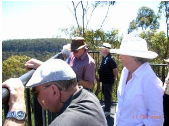
Members take in the view at Echo Point lookout.