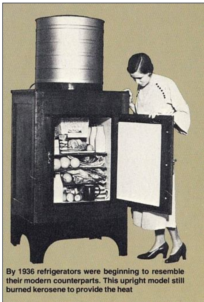
Illustrations are from "Australia's Yesterdays" a pictorial history book published by Reader's Digest in 1974.

sidecar, with the sergeant sitting in the sidecar like a statue of Buddha, while the police constable rode the motorbike.