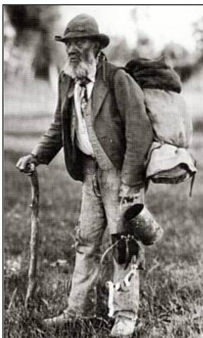
An old swagman in 1901.

I also remember myself trying to interrupt and tell him he could get boots at Bunters Shop, and my mum telling me to "shush" and go and play. Being a child, I had no idea he had worn-out boots and no money to buy any. I still cringe at my stupidity, with the memory of it.