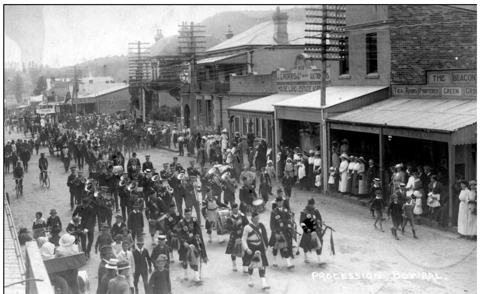
On the upper façade of the middle shop in this 1914 photo of Bong Bong St, Bowral appear the words 'JG Morris & Co, Auctioneers'.

February 2020: Meeting as normal on Wednesday 5 February.