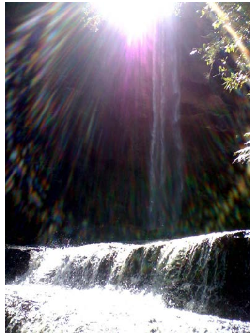
Flowing out of the deep pool at the foot of the first drop, where the lorry sank, the water becomes the second drop at Belmore Falls.

One can only imagine the commotion echoing through the gorge as the lorry plummeted down into the pool, witnessed only by nature's night life. A week later the Southern Mail (Bowral) advised that a diver had failed to locate the lorry resting in the deep pool at the foot of Belmore Falls.