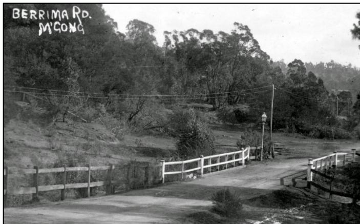
Ironmines Creek bridge on the Berrima Road, Mittagong, c1900, being the vicinity of the accident and where now is located the Mittagong RSL Club carpark entrance

“No warning had he, no chance of escape. It takes some time to relate these terrible occurrences, but unfortunately they take place very quickly.”