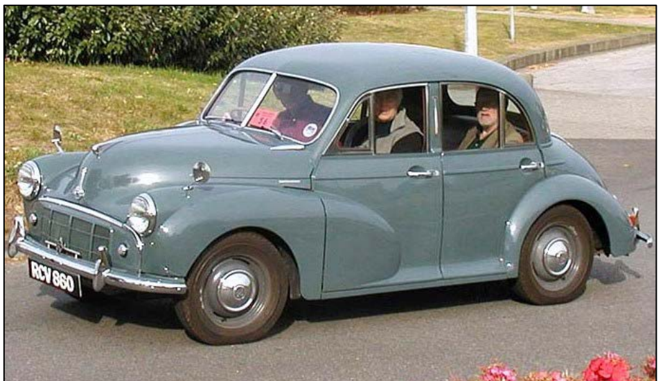
1950s icon of its day.

Proceeds will support the Bundanoon Heritage Trail. If you enjoy browsing, make a note of the date and head to the Bundanoon Hall, where you may discover some unexpected bargains.