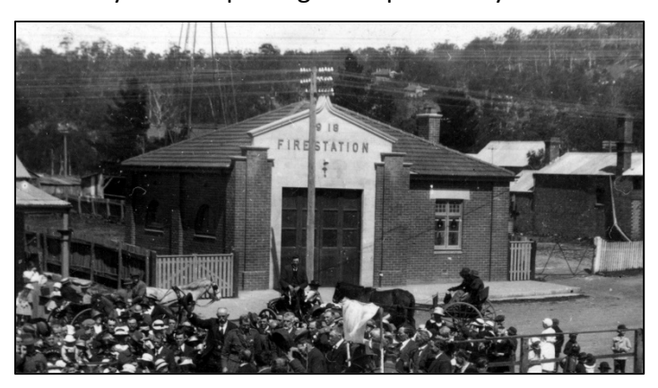
The newly built Station in 1919, photo taken at the occasion of the laying of the foundation stone for the Mittagong Memorial Clock Tower

were not only fighting fires, but constructing motor engines and other materials in their own workshops in Sydney, and building the engines £200 cheaper than they were importing them previously.