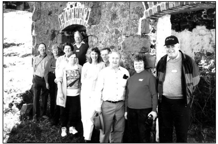
At Kiama - not sure what year or names to put to some faces, but a few current members are recognisable.