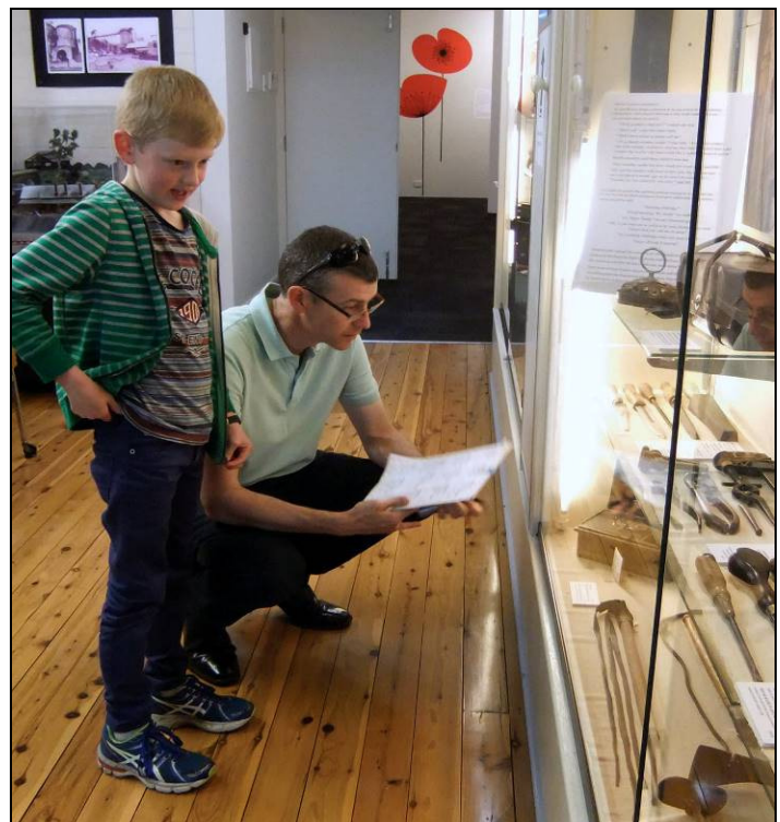
Museum visitor photos by Lyn Hall; compiled by P Morton