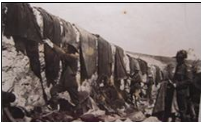
Drying Clothes after Ramaleh Stunt