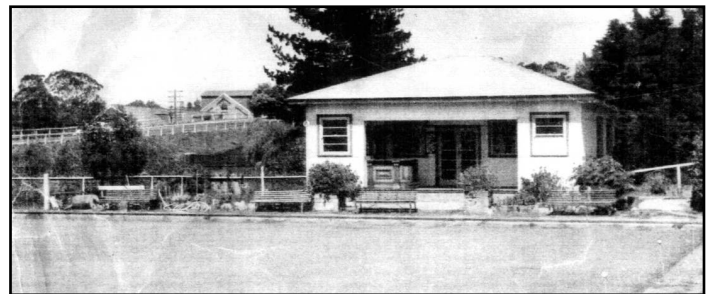
Original Mittagong bowling green near Hume Highway

The Main Roads Department submitted plans for eliminating the bridges to Nattai Shire Council in May 1946. A new road would be built proximate to the western side of the rail line, passing through the Bowling Club and a portion of the Golf Links. It offered to pay for the construction of a new bowling club on a site owned by Council. This deviation would by-pass both bridges by commencing a little north of Drabbles bridge near the nursery and re-join the Highway at the Maltings near the Sports Oval.