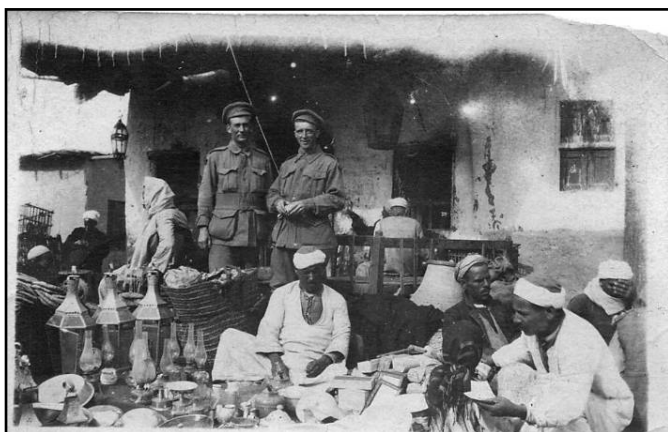
Egyptian Bazaar 1916