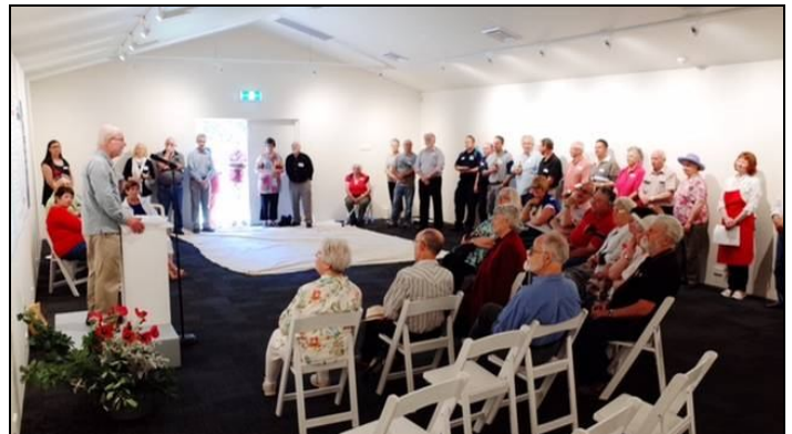
The new gallery is now ready for fit out and will soon be open to the public