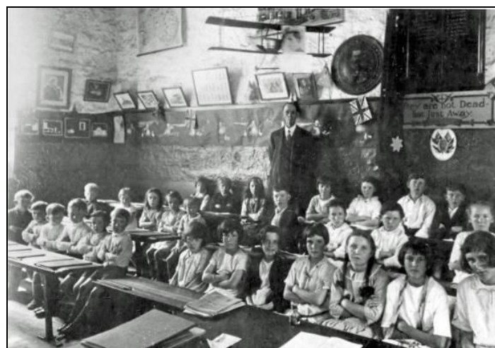
Sutton Forest Public School class in 1929