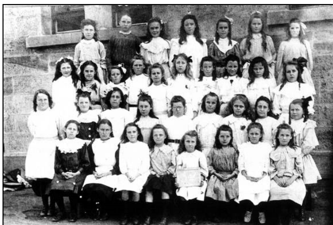
Sutton Forest Public School children, c1900