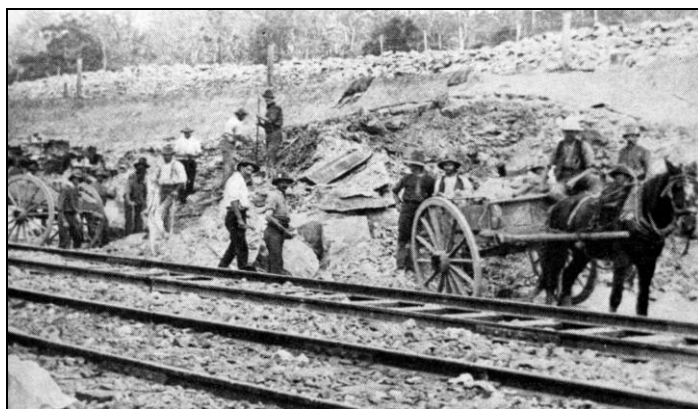
Workers with horses and carts on rail deviation south from Picton, c1915

The NSW Southern Railway brought improved conditions of travel for passengers and provided a better freight service than had the horse-drawn carts and bullock wagons it replaced. By the 1880s, productive grazing lands extended from Goulburn to the Riverina. Freight such as skins and hides was transferred to the railway. Live sheep and cattle were hauled to the Sydney markets in railway vans. Wheat production in southern districts had expanded significantly by the 1890s and, as exports grew, ever greater loads were carried by rail.