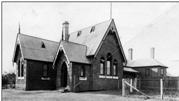
Sutton Forest Public School in its early years

A public school opened at Sutton Forest in 1880 and has continued to operate there ever since. However, at the end of this year it will close. As a tribute, this article presents an overview of schooling at Sutton Forest. The history is taken mostly from Silken Whispers , a booklet providing a general history of Sutton Forest, its schools and church published in 1960 for the 80 th anniversary of the public school.