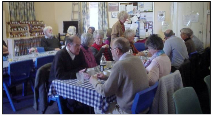
Society members and friends enjoy the June luncheon