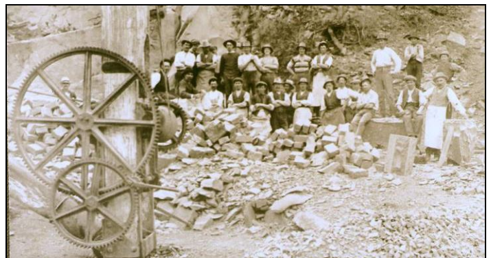
A group of Gib masons near the mast of a derrick crane.

The local district is by no means overlooked in the book, as it presents a detailed history of the extraction of trachyte from its pioneers and quarrymen through to heritage and conservation issues of recent times.