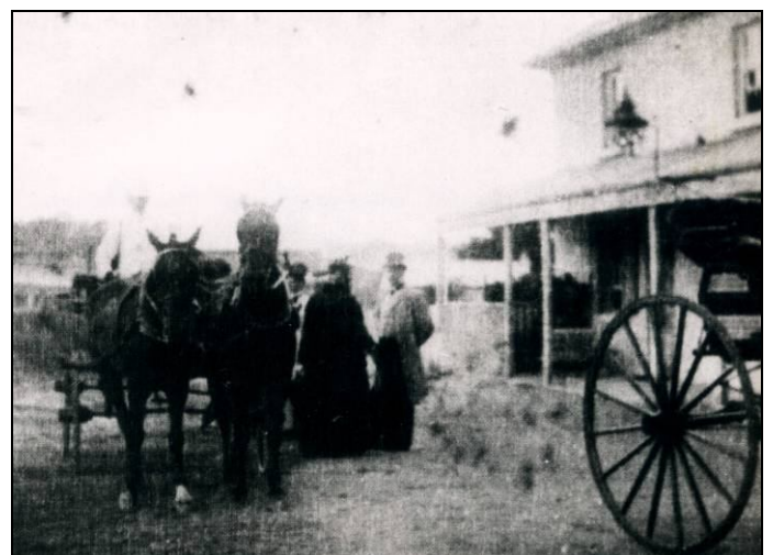
Travellers in Berrima at the Surveyor-General Inn.