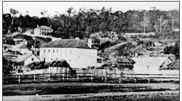
Early view of Berrima showing Harper's Mansion overlooking the town with Surveyor-General Inn in foreground.

Contact Chris on info@harpersmansion.com.au