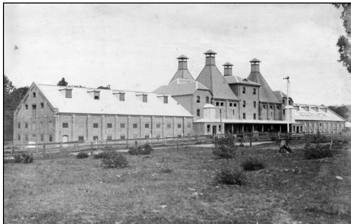
The imposing yet dignified buildings at the Mittagong Maltings have long fascinated locals and passers-by.