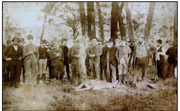
Lord Carrington at annual kangaroo shoot, Nandi, c1885