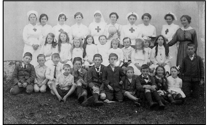
Kangaloon Red Cross Society outside the Hall in WWI

The Kangaloon community will this year celebrate the centenary of Kangaloon Hall in its present location. In the past 100 years the hall has been the focal point for many community events including weddings, parties, dances and concerts.